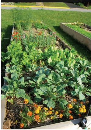
Community gardens are great candidates for grant funds.

Lexington residents seeking an opportunity to help improve the city's environment are invited to apply for a 2014 Neighborhood Sustainability Grant. Lexington's Department of Environmental Quality and Public Works is providing the grants, which are to be used by residents to work collaboratively and creatively to improve the environmental health of Lexington.