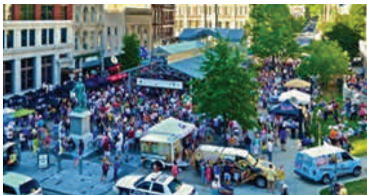
One of the Downtown Lexington Corporation's most well-attended events is Central Bank Thursday Night Live. Click here for more information.

A. For 19 years now every Thursday we have produced Central Bank Thursday Night Live in the heart